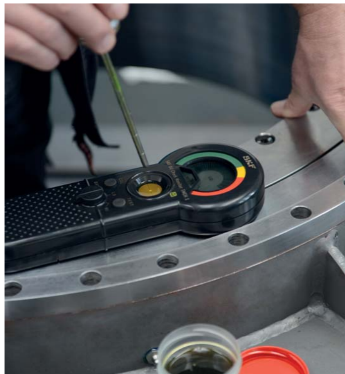
Oil quality measurement