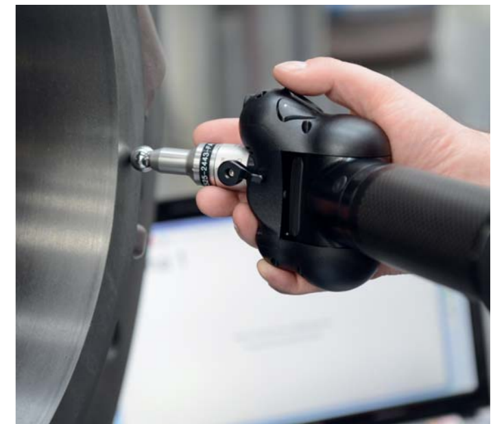
Mobile 3-D measurement of gearbox dimensions