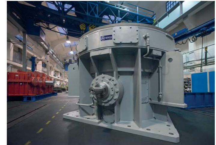
Vertical mill gearbox after refurbishment and upgrade